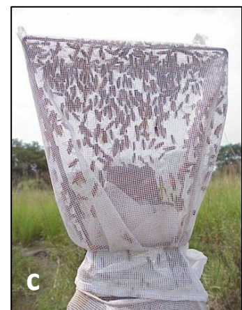
Figure 4. Vector capture: (a) Epsilon traps setup in the savannah ; Small (b) and large (c) cages used to collect insects.