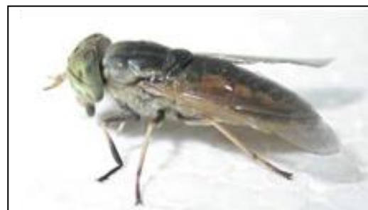
Figure 2. Tabanid- Trypanosome mechanical vector.