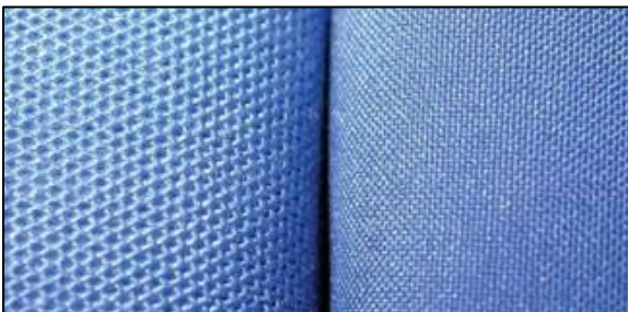
Figure 15. Two blue fabrics identical in appearance: on the left the more efficient "Santiago fabric" (made of cotton), and on the right an inefficient synthetic fabric.

The colour and the type of fabric are very important. Thus, different blue fabrics can have radically different attractive capabilities, and synthetic fabrics are often less attractive than cotton or blends containing cotton at the same wavelength (figure 15). In addition, some fabrics fade more easily under the effect of rain and the sun. The choice of the fabric is therefore crucial and it is necessary to refer to proven products. Multiple comparisons indicate that blue "Santiago" fabric is closer to phtalogen blue and is therefore recommended to use when making traps. The requirements for the black fabric (insect landing area) are less stringent than those for the blue fabric (the trap's attraction).