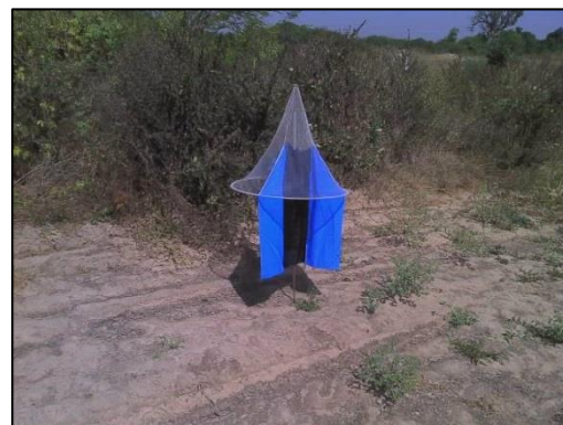
Figure 7. Vavoua trap impregnated with insecticides, used within the tsetse eradication campaign in Senegal.