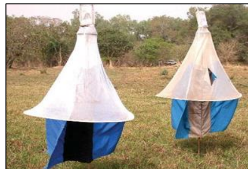
Figure 16. Vavoua traps: new, with bright color (left) and old, tired off and fade color (right)

However, traps may be made with local fabrics providing they have been validated under Latin square comparison with a reference fabric such as Santiago or TDV S250 Azur 023.