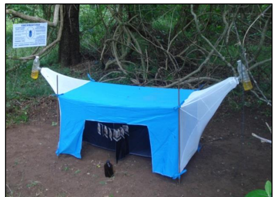
Figure 13. Photograph of the final H trap.

The « H » trap was developed at Hellsgate Tsetse Research Station in South Africa for the simultaneous collection of live Glossina brevipalpis and Glossina austeni . It was designed following a negative evaluation of the responses of the two species towards traps that are used elsewhere in Africa for the collection of other tsetse species. The odour-baited blue and black H trap represents a different approach for trapping tsetse flies as it is fitted with lateral cones of white netting which induce the flies to take a more horizontal flight path once they have entered the trap, instead of the vertical flight paths they assume in existing tsetse fly traps. A number of modifications of the prototype H trap were devised (H1-H5), before the final design was established. The final modification caught a record number of 180 G. brevipalpis and 57 G. austeni on a single day (figure 13).