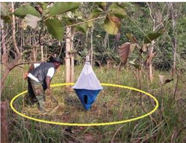
Figure 17. Cutting the grass around a trap

Always check the integrity of capture cages and the positioning of cones (keep a needle and sewing thread with you for ny eventual repairs in the field).