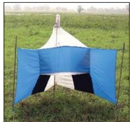
Figure 11. Nzi Trap.