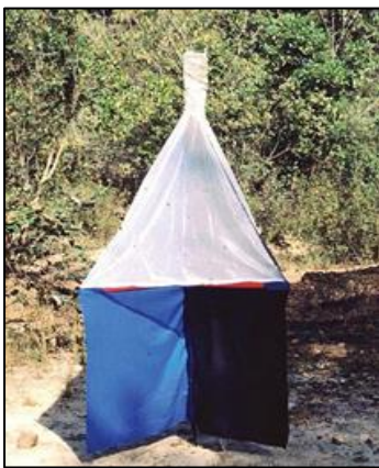
Figure 9. Pyramidal Trap.

The Nzi trap, developed at ICIPE by Steve Mihok, from NG2G model traps by Brightwell and al. (figure 11). Its front has got a blue horizontal rectangular panel with two blue rectangular wings fixed on stakes extending out at an angle of about 120° from the front. These 'wings' form an arch which is the trap's entrance. A trapezoidal piece of netting extends horizontally half-way into the body from the bottom of the blue shelf. The blue panels are connected to black panels forming a penetration cone. The back of the trap, held upright by a pole is made of mosquito netting for attracting insects towards the bottom and the top of the trap; there is a pyramidal shape made up of mosquito netting on top of the structure (light passing through attracts insects towards the bottom and then upwards), the top is closed by a cone (the anti-escape device) which guides insects into the last capture cage. The trap is secured to the ground by three external metal stakes and a central pole, or a flexible wooden stick, making it a relatively bulky and time consuming trap to setup (four metal stakes driven into the ground and more than eight adjustment points). It is suitable for the trapping of savannah tsetse, tabanids and Stomoxys . This is the most efficient trap for tabanids and the most "universal" trap for biting insects.