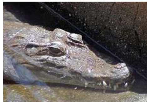
Figure 3. Reptiles that attract tsetse flies: monitor lizard (left) and crocodile (right).