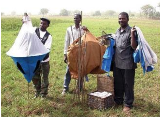
Figure 5. A team and its equipment during a vector monitoring campaign.

In G. pallidipes , a 4% daily extraction/harvesting of the female population normally leads to the elimination of their population due to tsetse flies' extremely low reproduction rate. However, the sole use of these methods does not lead to total eradication, even with an extraction rate of 100% because their efficiency, related to tsetse dispersal, is density dependent. It is therefore necessary to combine them, at the end of campaign, with other methods, such as the release of sterile males, or the replacement of the insecticide by a chemosterilant (bizazir) or an equivalent juvenile hormone that prevents pupal development.