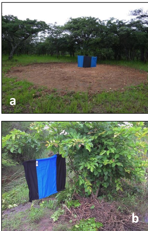
Figure 6. Blue-Black-Blue target set to control tsetse in Zimbabwe (a) and Black-Blue-Black target set to control tsetse in Senegal (b).

Tabanid trapping is essentially carried out for entomological or epidemiological studies; its effectiveness in the trypanosome fight has not yet been validated, however capture scores observed in some contexts suggest that trapping can contribute to the reduction of tabanid population densities (figure 4c).