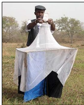
Figure 10. Screen- Trap.