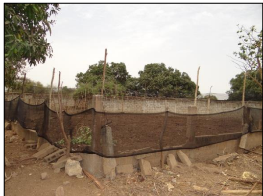
Figure 19. Installation of ZeroFly® (modern farm on the top and traditional pen at the bottom)