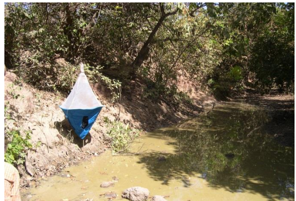
Figure 18. Proper placement of a biconical trap along the water's edge in Burkina Faso.

When using a NZI trap, make sure that the trap opening is facing an open area, ensure correct tension, and the trap should be placed as close as possible to the ground. In the forest, direct the trap opening to a clearing. On forest edges, place the trap more than 15 m from the forest. The distance between traps must be greater than 200 meters in an open environment.