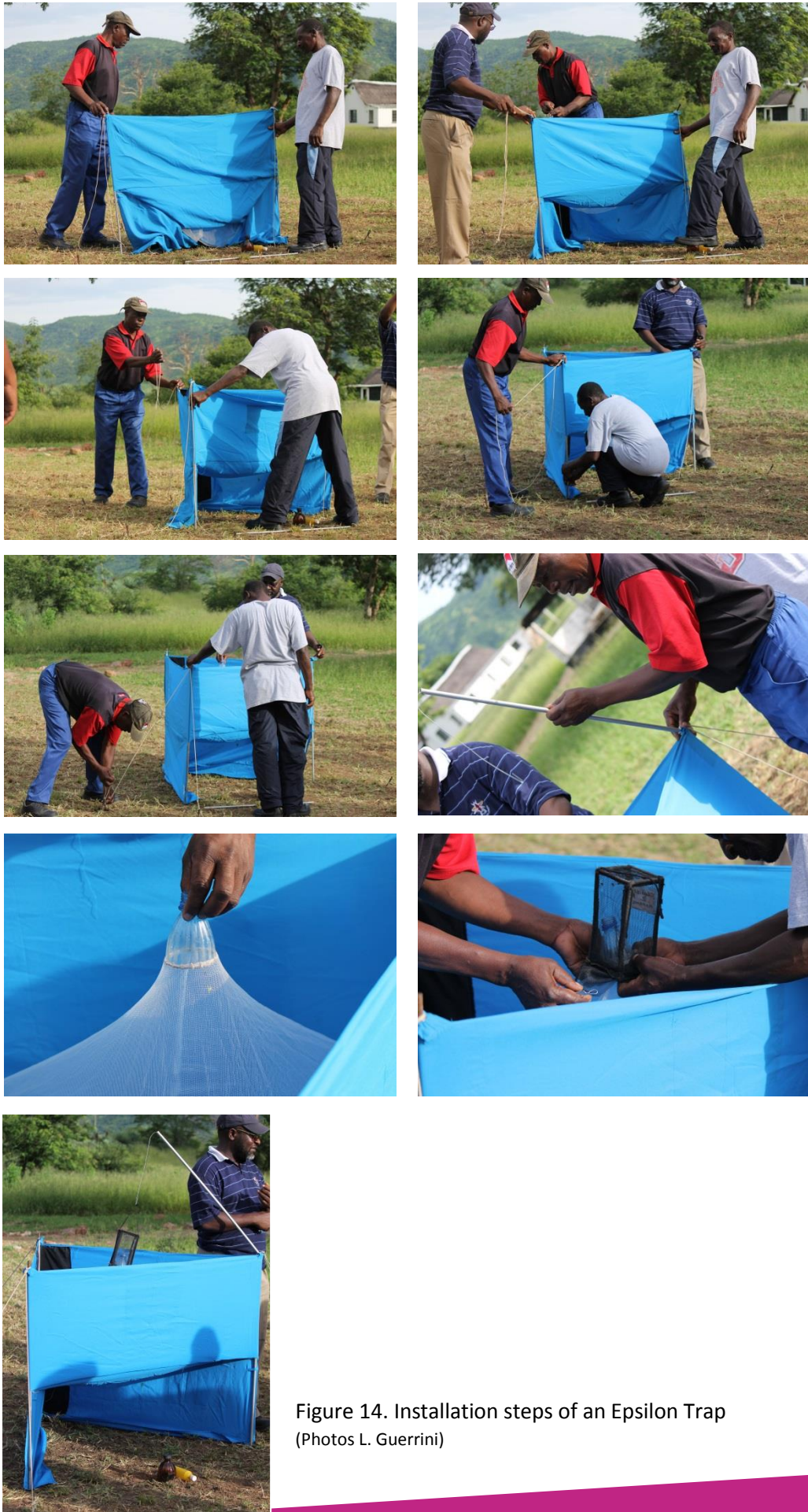
Figure 14. Installation steps of an Epsilon Trap