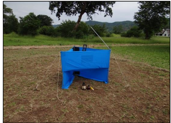
Figure 12. Epsilon Trap.

The Epsilon trap was developed in Zimbabwe for trapping savannah species such as Glossina pallidipes and Glossina morsitans (figure 12). The trap is an equilateral triangle with a side length of 120cm and the lower half of the front is folded back into the trap to give a horizontal shelf. The outside of the trap is blue and a vertical black cloth (0.5 x 1m) is sewn into the rear of the trap to elicit a landing response inside the trap as well as creating a dark environment. The top of the trap is covered with netting material to create a cone which is recessed with its apex level with the top and forward of centre. A plastic cage is used to collect trapped tsetse. The trap is supported internally by aluminium poles held upright by guy ropes. The installation steps of an Epsilon trap is presented in figure 14.