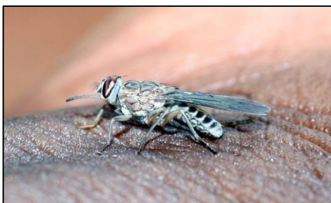
Figure 1. Tsetse fly- Trypanosome cyclic vector.

Hunger is a critical factor that cyclically increases the search for a host; thus in tsetse, the daily capture of previously marked and released laboratory flies presents sinusoidal patterns whose peaks correspond to the period in-between meals. The gestation period, which increases appetite on days 1 after fecundation and days 6-7 in tsetse, also results in the increased capture of females.