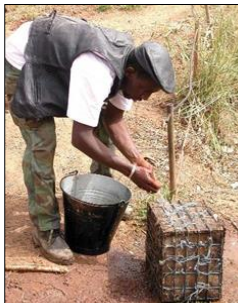
Figure 20. Regular moistening of container containing cages with alive insects for dissection.

Insects will barely survive prolonged exposure to the sun and they quickly dry after death or they damage their wings on the sides of the cage if traps are not checked and emptied regularly. In such cases, one can only summarily identify and count them. Another possibility is to keep the cages in ice boxes containing cool-packs which maintain a temperature of \sim 10^{\circ}\text{C} .